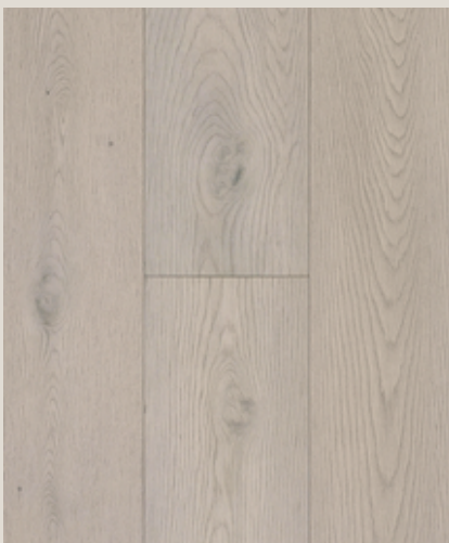
Available in AB Grade.

Vivacious, pure, & timeless. Add a touch of brightness, space and light to the room with this contemporary tone.