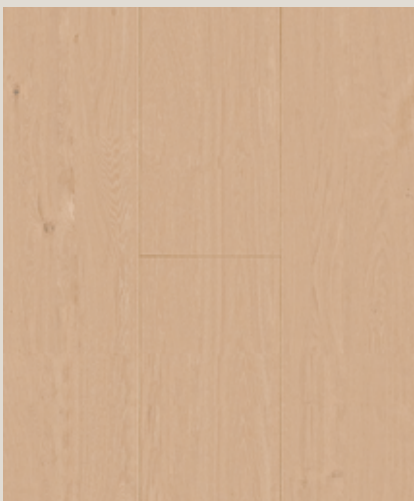
Available in AB Grade.

Showcasing graceful wood textures, Hamilton Oak blends classic character with contemporary sophistication for versatile interior appeal.