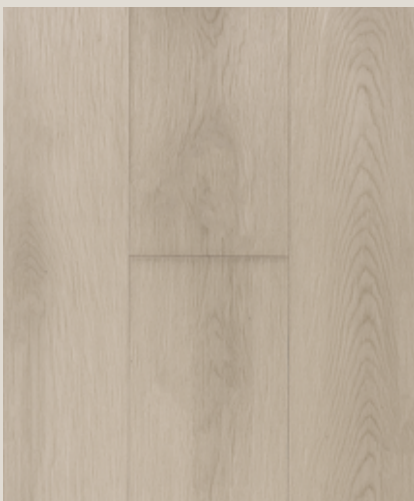
Available in AB Grade.

Balmy, fun & optimistic. Create a peaceful atmosphere whilst illuminating a dark room with light oak flooring.