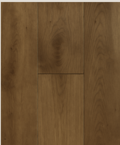
Available in AB Grade.

This deeply smoked brown oak collection radiates warmth and depth, giving a sophisticated feel that expresses imagination.