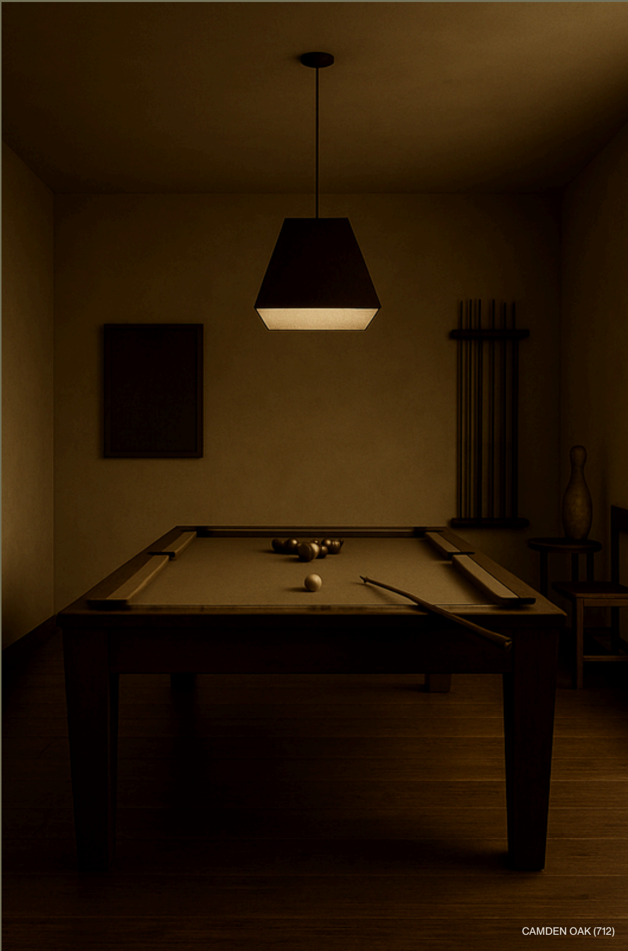
CAMDEN OAK (712)